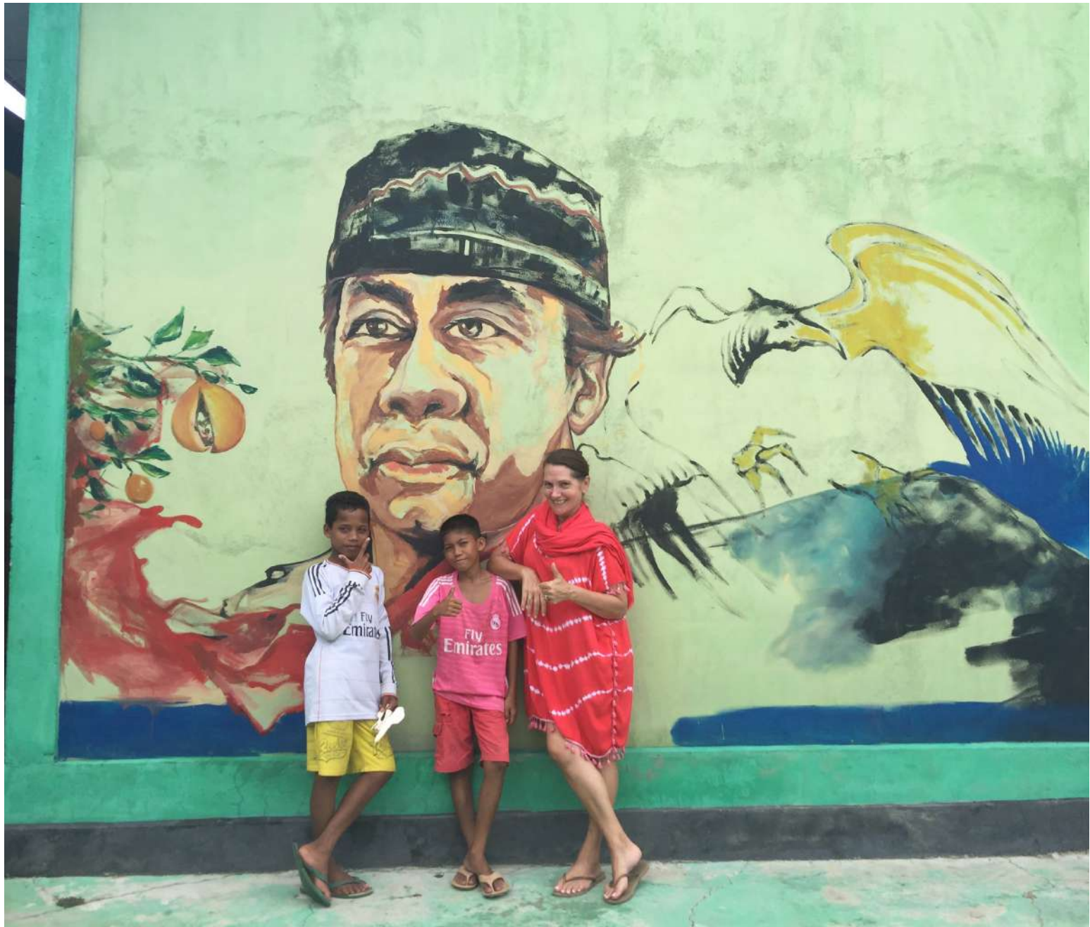
A portrait of the legendary Des Alwi, affectionately called the unofficial King of Banda Neira, painted on the primary school wall on Run Island.